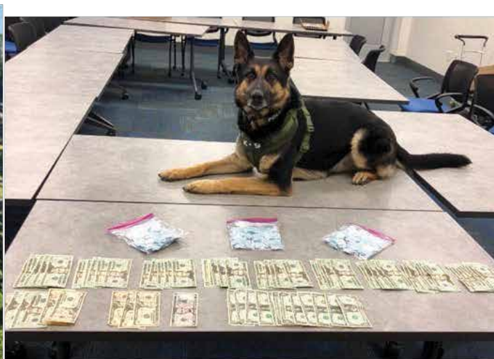
Drug Box in our 24 hr. lobby An internet exchange location K9 Casper a drug finding land shark

In 2020, every sworn officer now utilizes Body Worn Cameras during their duties.