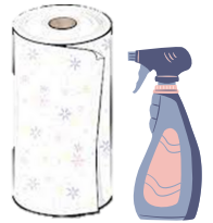
Cleaning Spray & Paper Towels