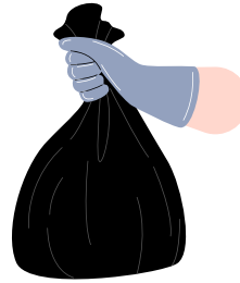
Rubber Gloves & Trash Bags